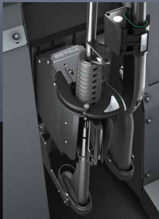
Shown with "VaultLock" firearms mounting system