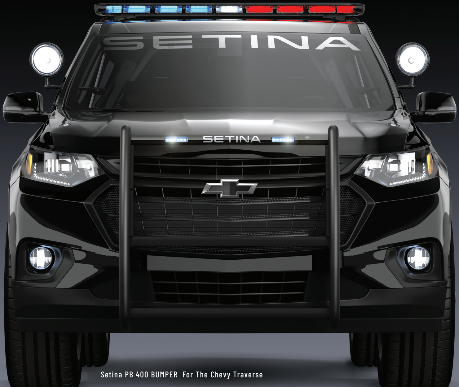
Setina PB 400 BUMPER For The Chevy Traverse

Setina always designs with purpose. Our goal is to provide law enforcement with superior cargo storage solutions for firearms, cargo, and communication equipment. Our innovative modular designs and advanced locking systems offer flexibility, security, and easy accessibility, tailored to meet specific fleet needs. We've created a space for everything.