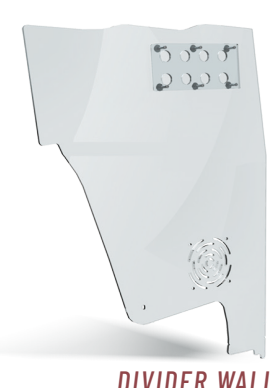
DIVIDER WALL KIT