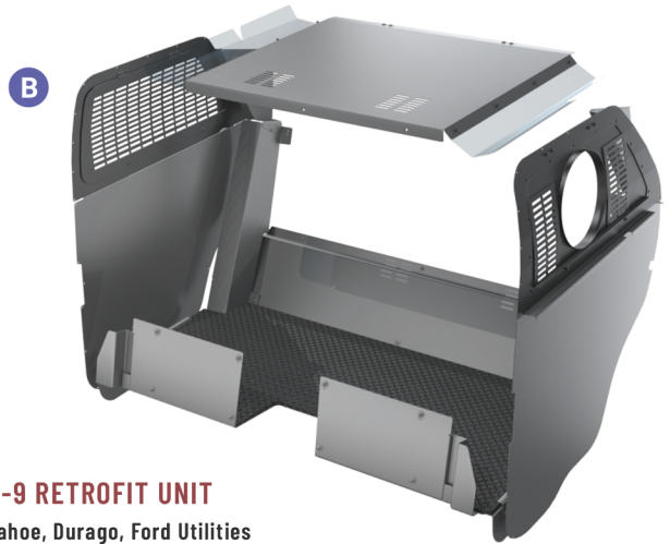
K-9 RETROFIT UNIT