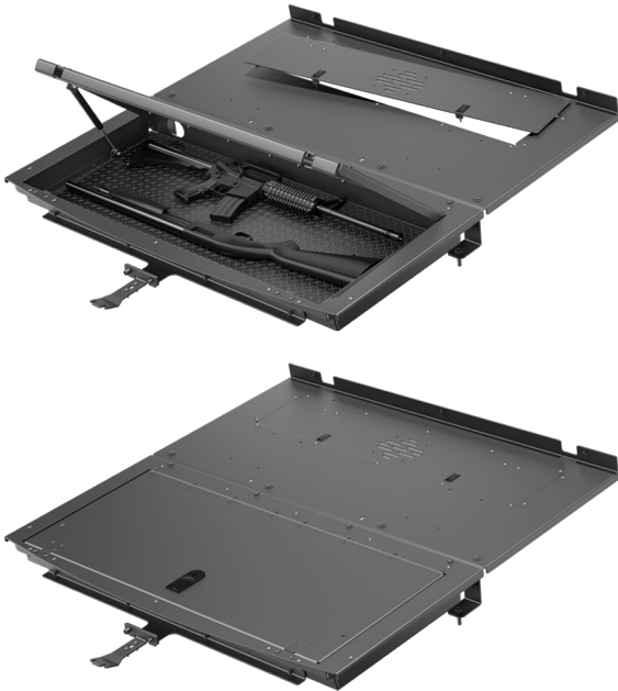
TAHOE PPV CARGO DECK TK1445TAH2

The Forward Bay includes a Vented Lid for Electronics. The Rear Bay includes a Gas-Strut Assisted Lid and Lock for Firearms and Cargo storage.